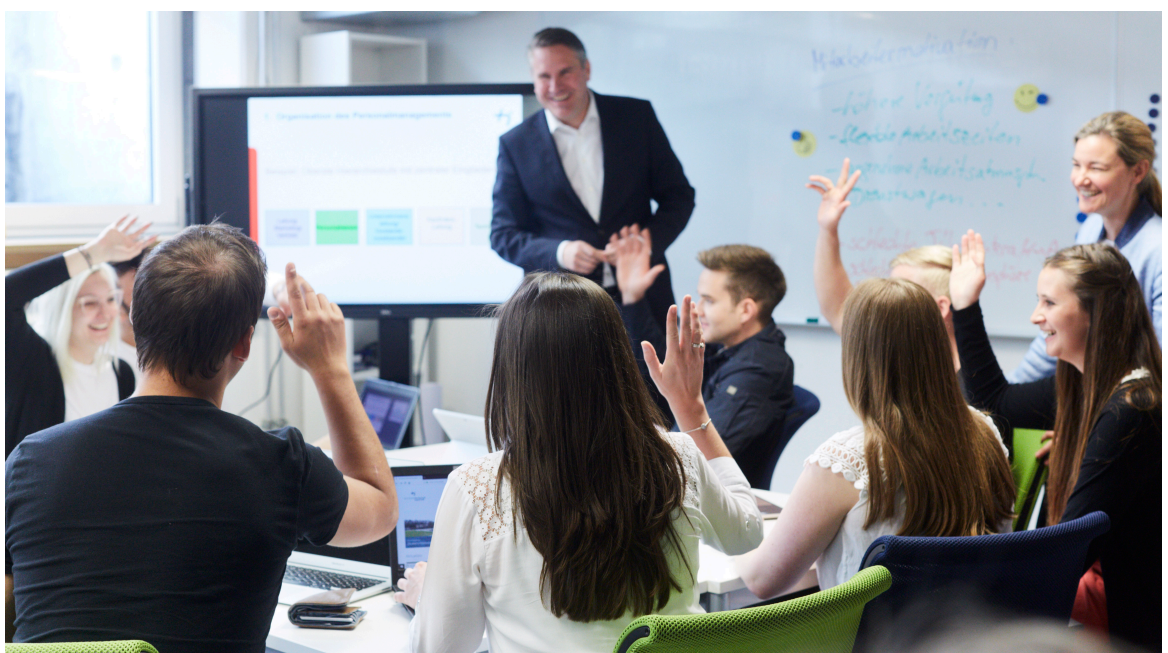
Small groups and individual work on project make studying at THI special.