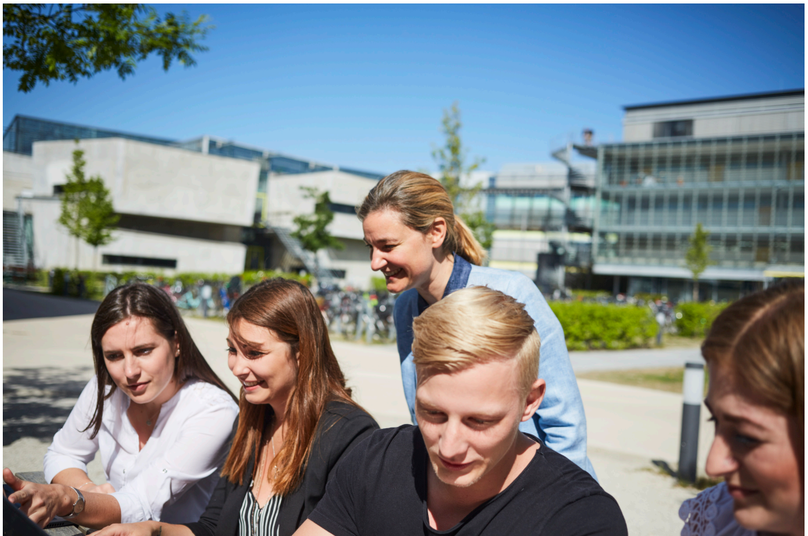
Students enjoying an extensive campus on the edge of the old town surrounded by greenery.

thank you for your interest in the master's courses at THI. In the following you will find the most important information about the master's courses, the application, the qualification requirements and much more in a nutshell.